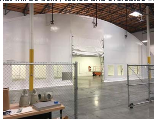
New 3,000+ sq ft WIAMan lab under construction at DTS

DTS is the Prime Contractor to the US Army for this important project, which includes designing the new ATD (anthropomorphic test device) and a next generation in-dummy DAS and sensor solution. Technical papers on WIAMan were presented at the STAPP Car Crash Conference in Washington D.C. last month.