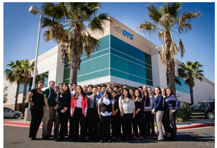
Future Engineers – Students from Cabrillo High School in Long Beach got a first-hand look at DTS's corporate headquarters in Seal Beach, along with encouragement and advice on pursuing careers in technology fields.

Founded in 1990, DTS data recorders and sensors are used worldwide in crash, blast and biomechanics testing by top automakers, aerospace and leading research facilities. The U.S. Army named a DTS helmet sensor as one of "The Greatest Inventions." Inc. Magazine has named DTS three times as one of the fastest-growing private companies in the U.S. Based in Seal Beach, California, DTS has technical centers in Michigan, U.K, France, Japan and Asia Pacific.