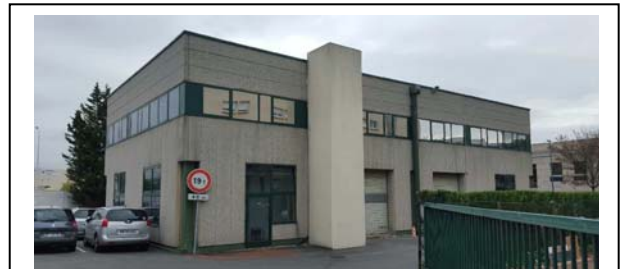
Located in Gennevilliers, the new DTS France Technical Center supports customers throughout Europe.