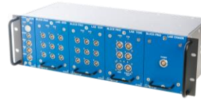
SLICE PRO LAB Non-Rugged System