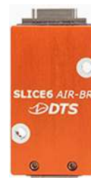
SLICE6 AIR-B SENSOR INPUT - 37 pin Nano D connector - 6 available inputs for BRIDGE/PR/VOLTAGE

Thermocouple connection available Contact sales@dtsweb.com for more info