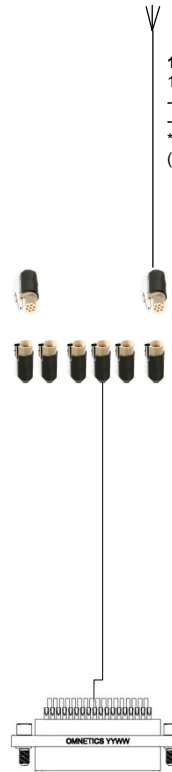
13006-90880 37-p Cable Assy - 152mm/6 in leads - 6 x 7-pin circular connectors